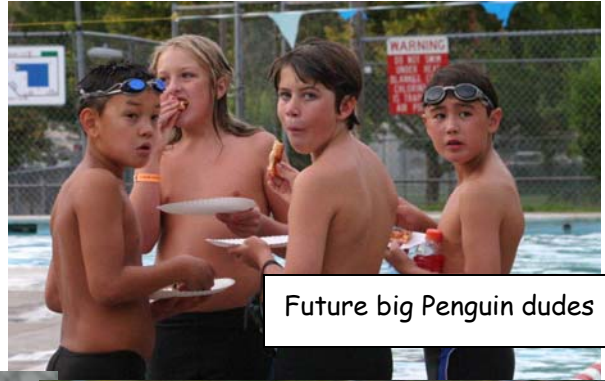
Future big Penguin dudes