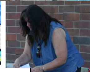
Just a few of the Unheralded Penguin Parent Volunteers