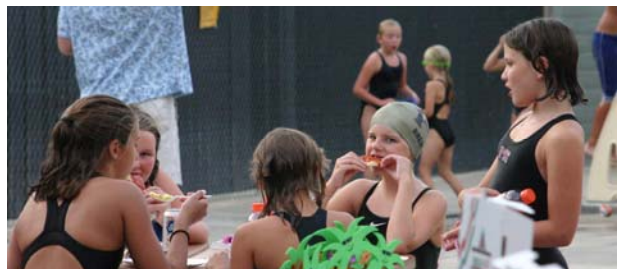
Future big Penguin gals