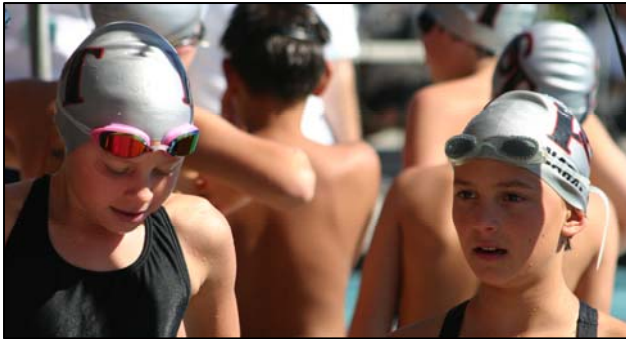
Penguin teammates cheer each other on in the relays