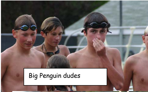
Big Penguin dudes