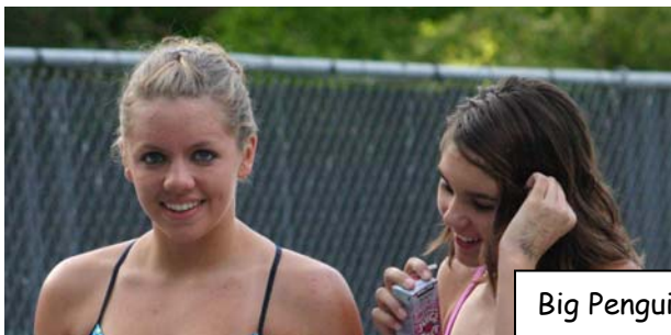
Big Penguin gals