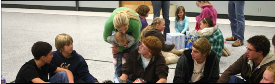
Above: Penguin dudes exchange gifts